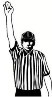
PLAY-ON OR STOP THE CLOCK (PLAY IS SUSPENDED)