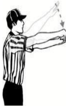
WITHHOLDING BALL FROM PLAY