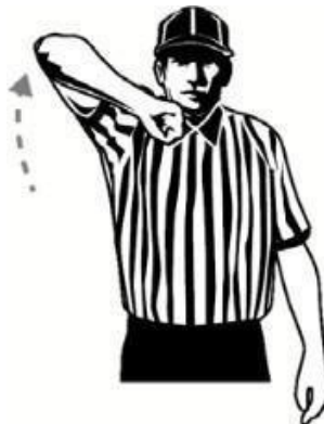
ILLEGAL BODY CHECK