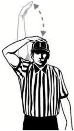
FAILURE TO ADVANCE OR SHOT CLOCK VIOLATION