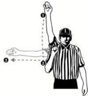
DIRECTION OF POSSESSION