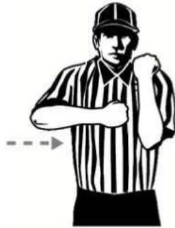
ILLEGAL OFFENSIVE SCREENING