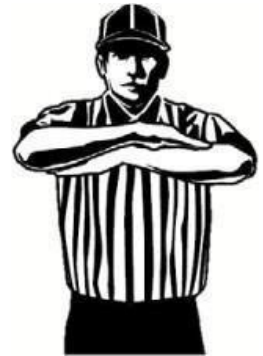
DELAY OF GAME